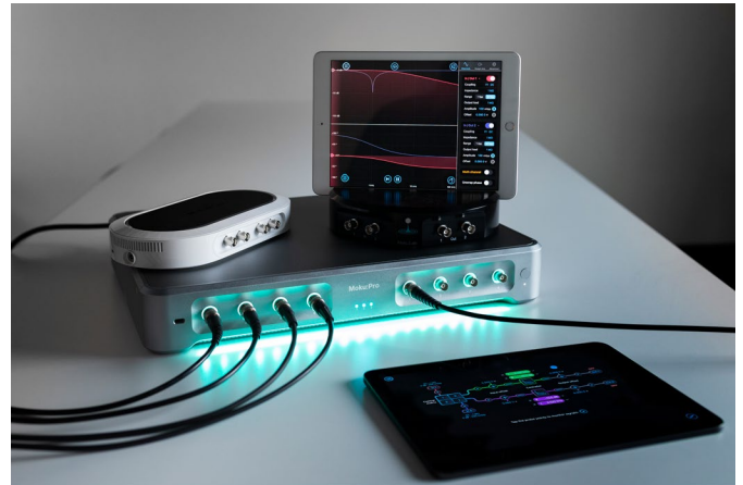
Figure 1. Liquid Instruments' Moku family gives researchers multiple scientific instruments in a single platform

Website: https://www.liquidinstruments.com/